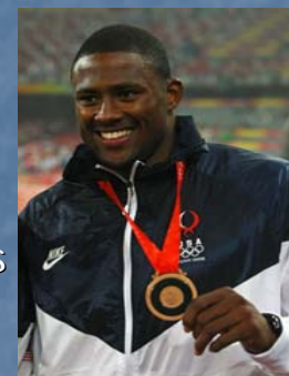
Pictured: Stephanie Brown Trafton & David Oliver